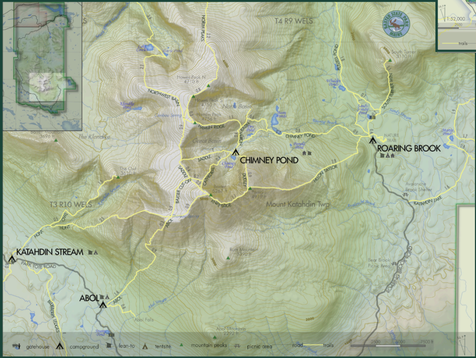
Map courtesy of Baxter State Park