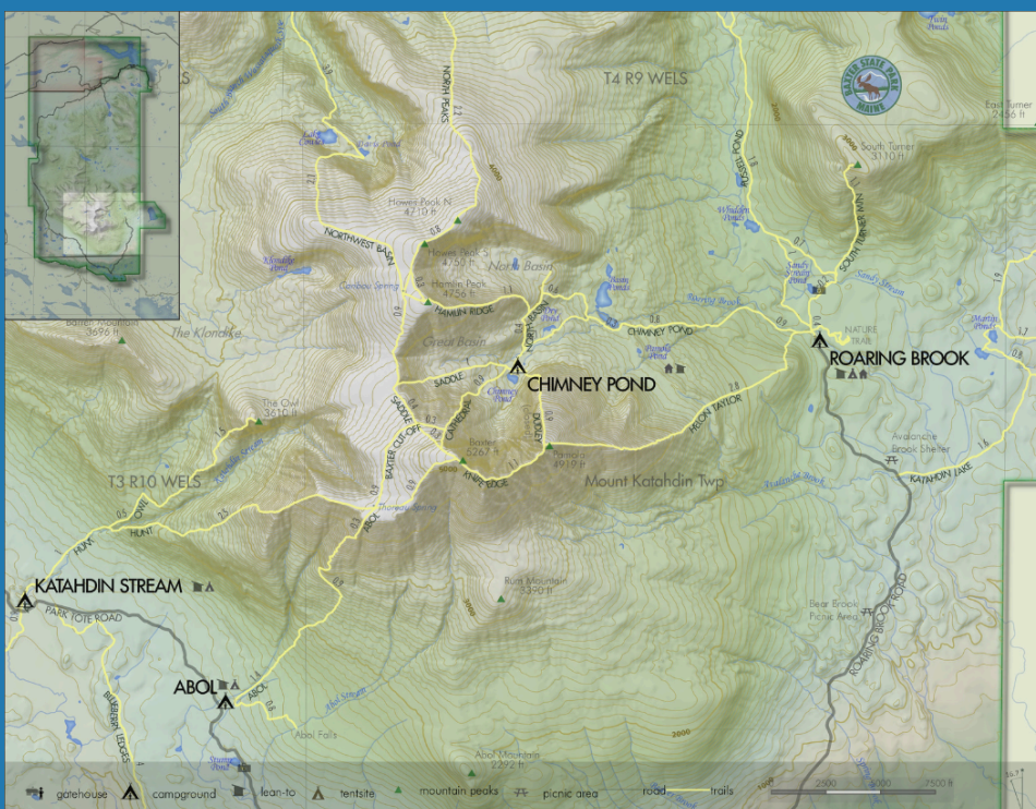
Map courtesy of Baxter State Park