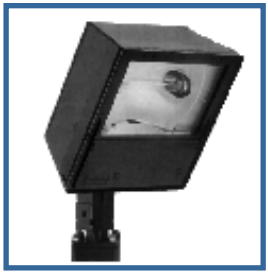
Floodlights or lights not aimed downward